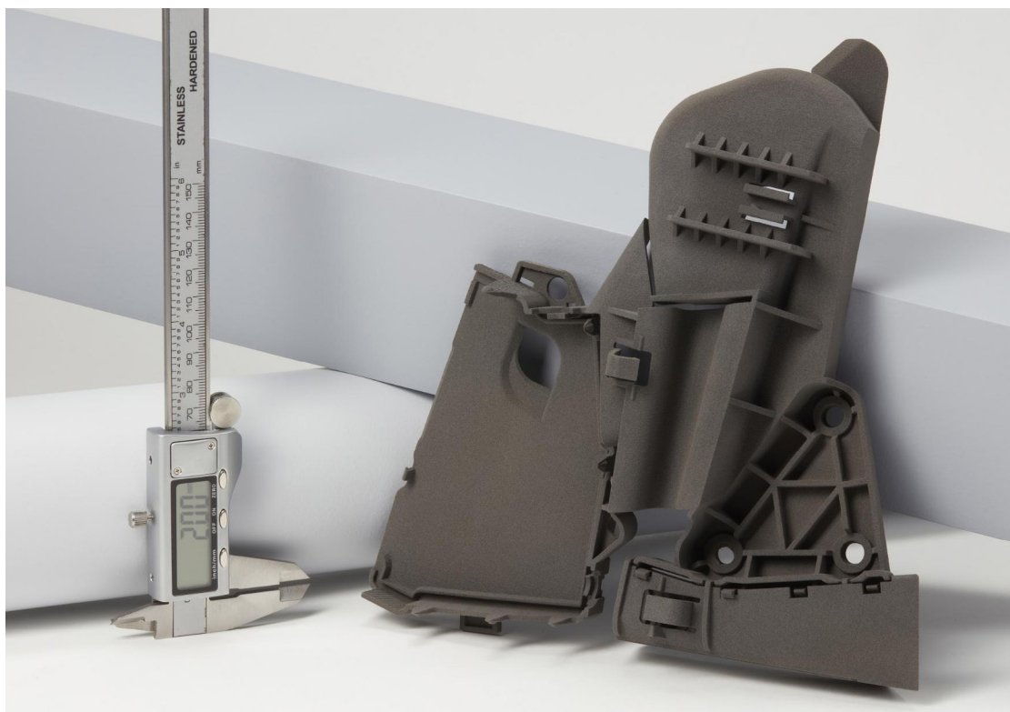
A 3D printed door handle module spare part that is traditionally injection molded.

"That's a big waste of resources, a big waste of space, and a big waste of money. If we 3D print them, we don't need to store the injection molds and the parts for the next 15 years. There's a lot of demand for spare parts and end-of-life parts, because products always run out, and we do have a lot of plastic injection-molded parts. If we can stack them nicely and bring the build up to a very high density, it gets cost-efficient," said Kleylein.